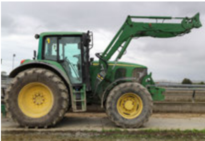
John Deere 6920S- 2007 9687 Hrs – Fully Serviced Next service: 9,750 hrs