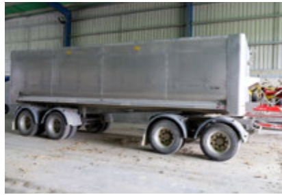
Lusk Engineering Bathtub trailer – 2006 Reg H338