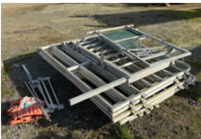
Prattley Cattle Yards