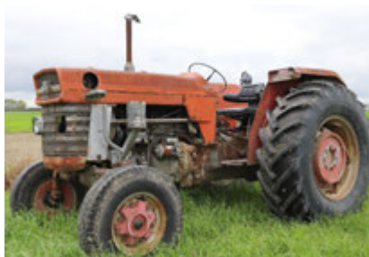
Massey Ferguson 175 1964/1972