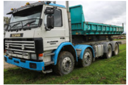
Scania P113-1996 475,748 kms - Reg UM8047 Tipping Deck