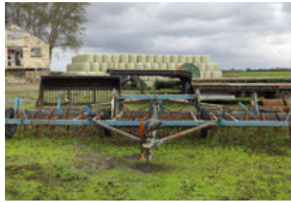
Campbell and Bowis Maxi-till Cultivator 7.5 metres