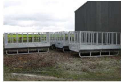
Riverdown Bale Feeders x 5 2025