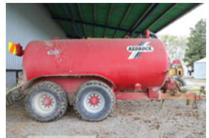
Redrock Slurry Tanker – 2011 2,500 gallons capacity