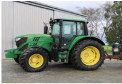
John Deere 6125M – 2015 3,938 Hrs- Fully Serviced Next Due: 4,125