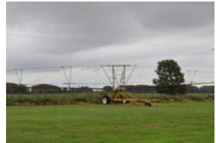
Briggs Roto Rainer