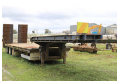
Roadmaster low loader – 2000 Timber/ steel deck Reg F553E