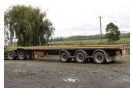
2004 Steelbro Trailer 331-3R