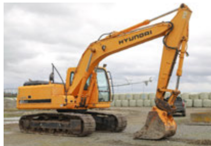
Hyundai Rolex Excavator - 160LC7 5,318.9 hrs