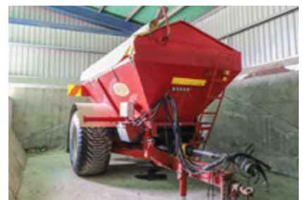
Bredal K105 Spreader – 2007