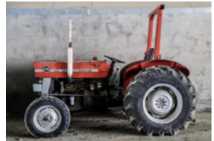
Massey Ferguson 135 1964/1972