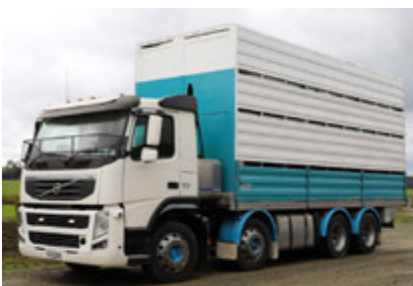
Volvo 500 Euro 5 – 2011 1,168,079 kms - Reg FYU394 Delta stock crate