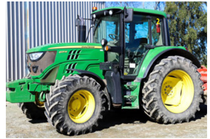
John Deere 6125M – 2014 2565 Hrs – Fully Serviced Next Due: 2,625 Hrs