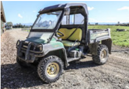
John Deere Gator XVU855E 4,442 Hrs