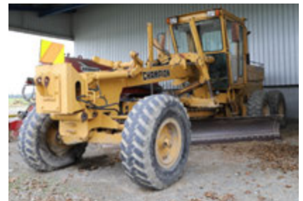
Champion 720A Grader 18,737 Hrs