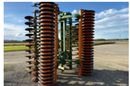
Amazone Catros 6000