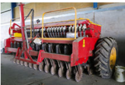
Duncan 740 Enviro Multidrill Seeder – 2002