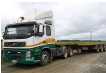
Volvo 440 Transporter – 2008 1,216,995 kms - Reg EGZ152