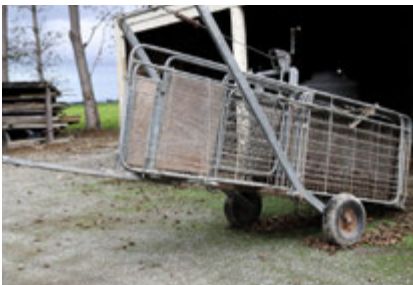
Prattley Mobile Sheep Yards