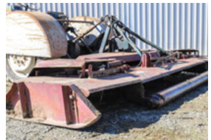
Large mower – 4 Blades