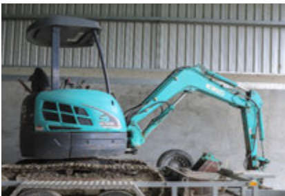
Kobelco SK30SR digger with attachments and trailer 2,816 Hrs