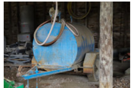
Diesel Trailer Tank