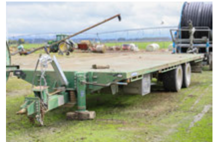
Chieftain Trailer – 2014