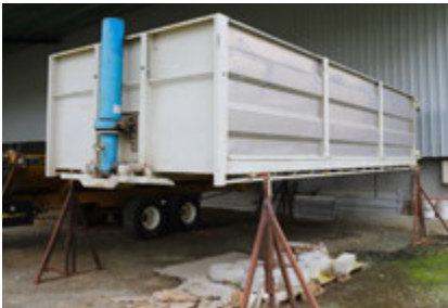
Lusk Engineering Truck bin