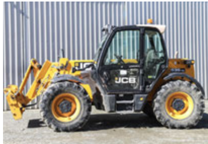
JCB 536-60 – 2014 3,855 Hrs – Fully Serviced Next due: 4,000