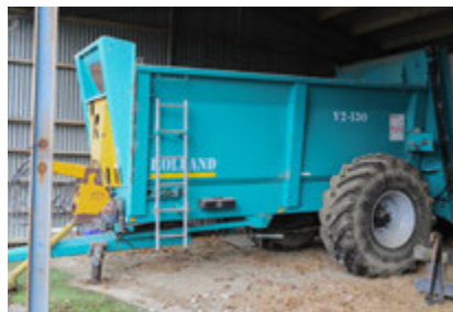
Rolland Muck Spreader V2-130 Bin – 1999