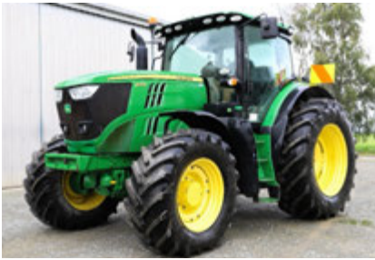
John Deere 6175R – 2016 3,002 hrs – Fully Serviced Next Due: 3,375