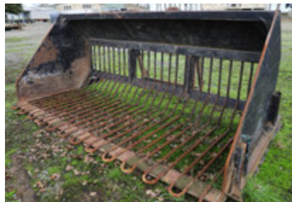
Rata Beet bucket – 3 metres