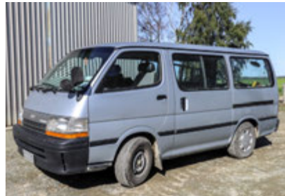
Toyota Hi Ace Van 1992 300,000km