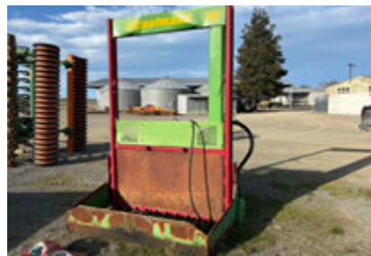
Strautmann Silage Face Cutter Grab