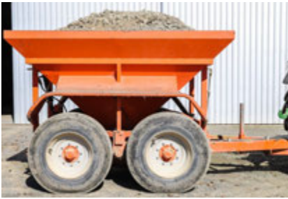
Stone Cart – Double Axle