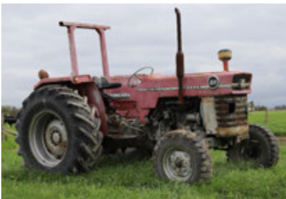
Massey Ferguson 168 1972/76