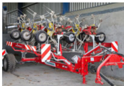
Poettinger HIT 12.14 Tedder – 2014