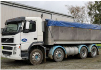
Volvo FM12 – 2004 1,497,037 kms – Reg EZW231 T/T Bin with tarp